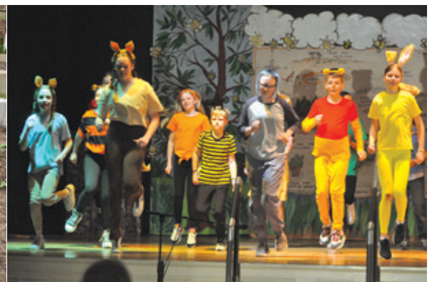
Winnie the Pooh