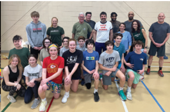
8th Grade vs. Faculty Basketball