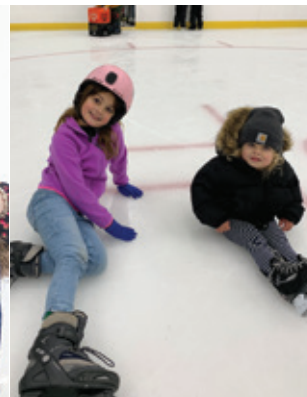
Ice Skating Party