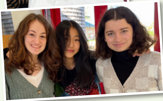
< Thanksgiving Feast 2022