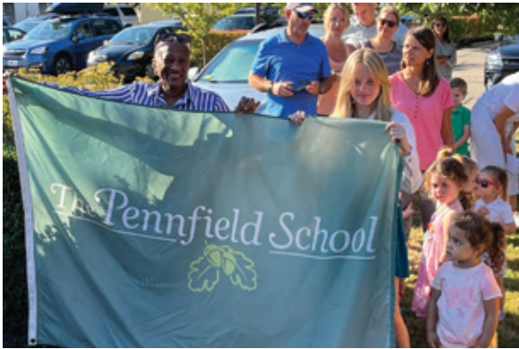
Opening Day of School