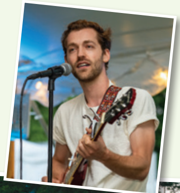
Pennfield's 50th Gala >