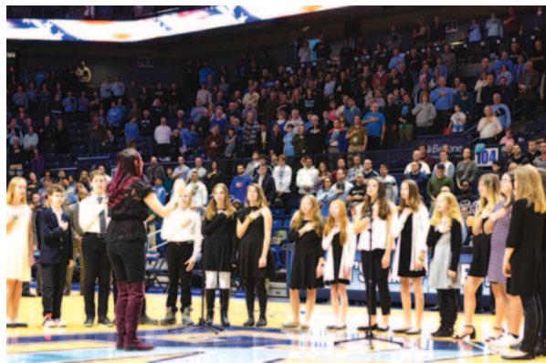
Rolling Tones Sing National Anthem