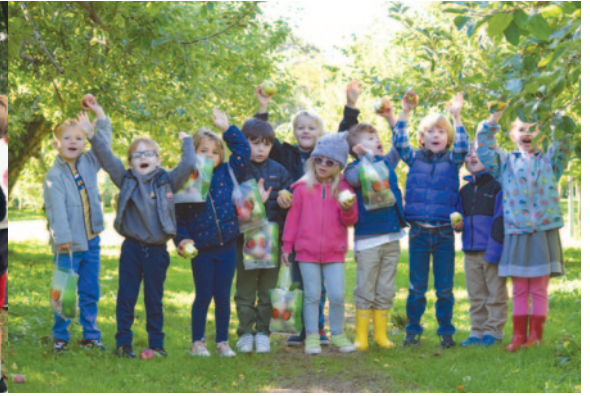
Apple Picking with Kindergarten