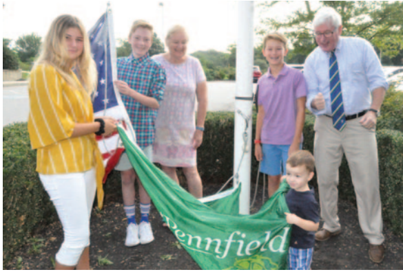
Opening Day of School