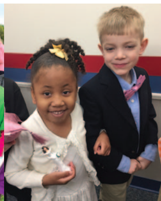
The Wedding of Q and U