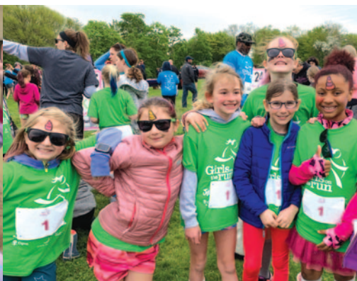
Girls on the Run