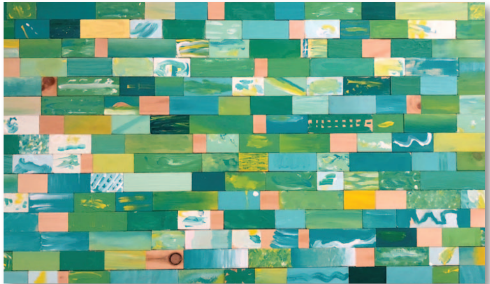
Student Collaboration - Pennfield Pieces