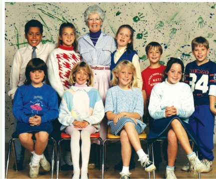
LEFT: Class photo from 1988