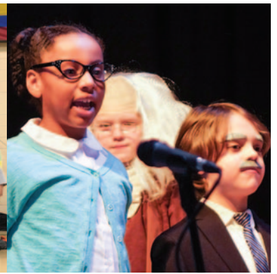
Lower School Play