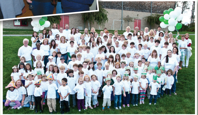
BELOW: Pennfield's 40th Birthday Celebration