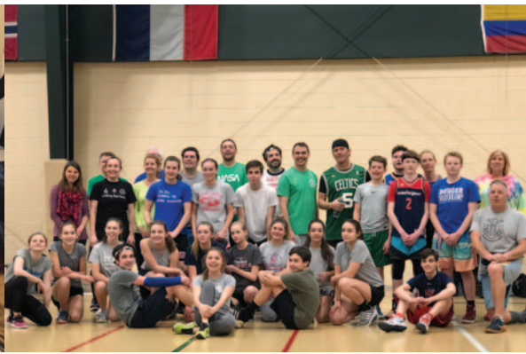
8th Grade vs Faculty Basketball