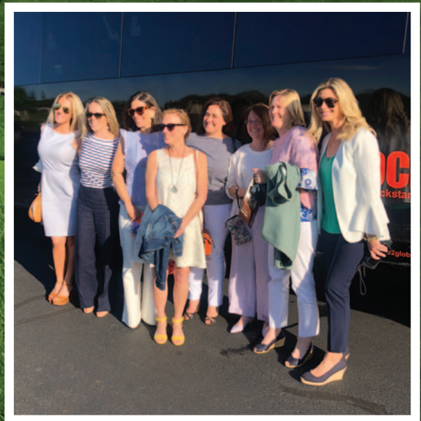
ABOVE: Thanks to All Occasion Limo for providing transportation for the tournament reception.