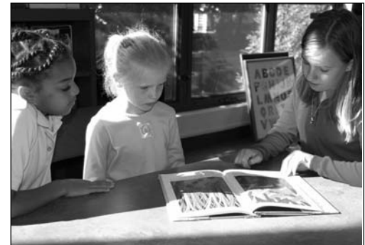
TOP & ABOVE: Grade Six students spend quality time with their Kindergarten and Grade I buddies.

At the beginning of the year, each Lower School class was paired with an Upper School class to be Buddies for the year. Time was built into the schedule for the classes to meet so that students could become acquainted, plan projects together, and learn how they might help one another in other ways. Students