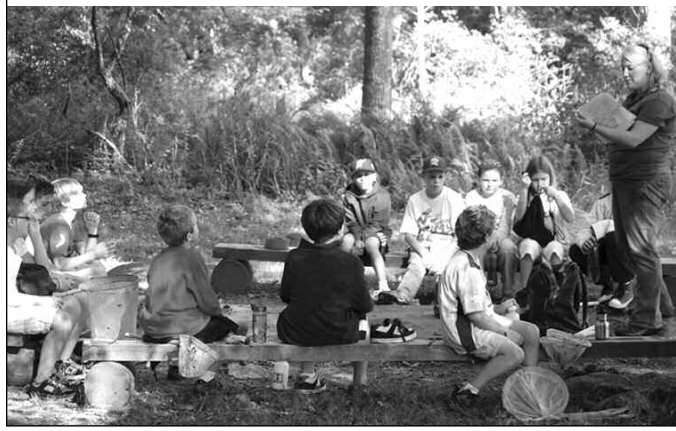
Fourth and Fifth Grade students watched skits around the campfire and enjoyed a hike — outdoor education at its finest!

Students participated in group-building activities with their field groups. The highlight of the trip each year is a two-hour game of Predator/Prey, where students become immersed in a simulated wildlife food chain. Students, teachers, and chaperones always have such a fun time on this trip. It's one I look forward to every year.