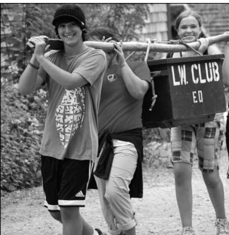
Grade Eight students at work and at leisure.