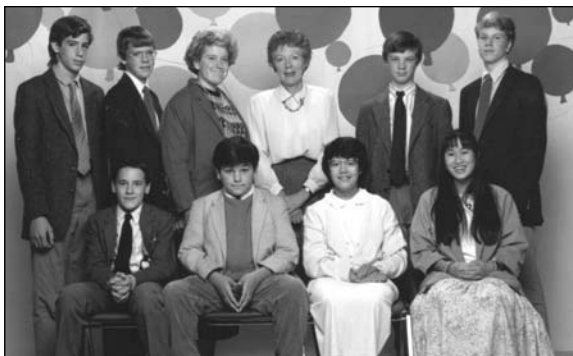
Class of 1988 - Eighth Grade Year